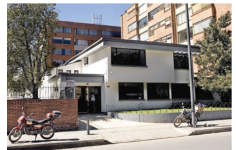
Bogotá's Comprehensive Care Centre