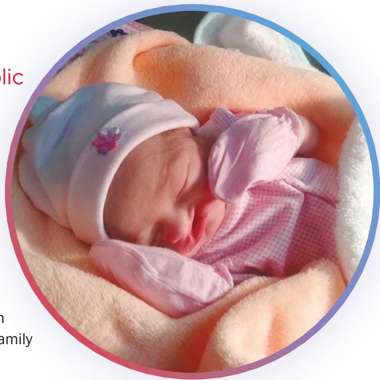
Sherlin, from Dominican Republic

Sherlin's journey included reconstructive lip surgery , followed by palate repair , and later a bone graft , all part of a long-term, carefully coordinated treatment plan. Each milestone required patience, discipline and unwavering family support — and each brought Sherlin closer to thriving.